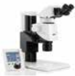
Leica Digital Microscope