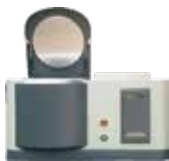
XRF RoHS Analysis Testers