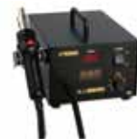
Hot Air Welding Platform