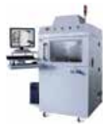
X-Ray Non-Destructive Testing Fluoroscopy Tester