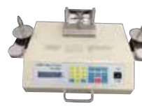
SMD Components Counter