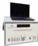
Semiconductor Testing System